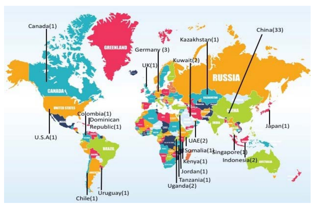
Figure 1. Locations of study (Masters programme, 2017 / 18 Academic year, n = 60)

This research was carried out on two distance post graduate programmes at Leicester University: International Education (a 2-year masters programme) and a Learning Technologies (an 8-month post graduate certificate programme). Our familiarity with these two courses was the main reason for this choice. The participants of the masters programme are located around the word (see Figure 1) while those on the PGC programme are mainly from the UK.